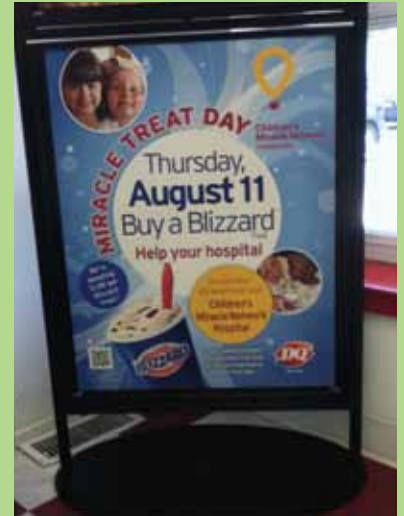
Dairy Queen Miracle Treat Day was August 11, 2011. Dairy Queen donated $1 for every Blizzard sold to Children's Miracle Network Hospitals. Blizzards for all the Hamilton Horizons Staff!

Financial Tip: Avoid using your debit card at a hotel or gas station—they add temporary holds for more than you purchase.