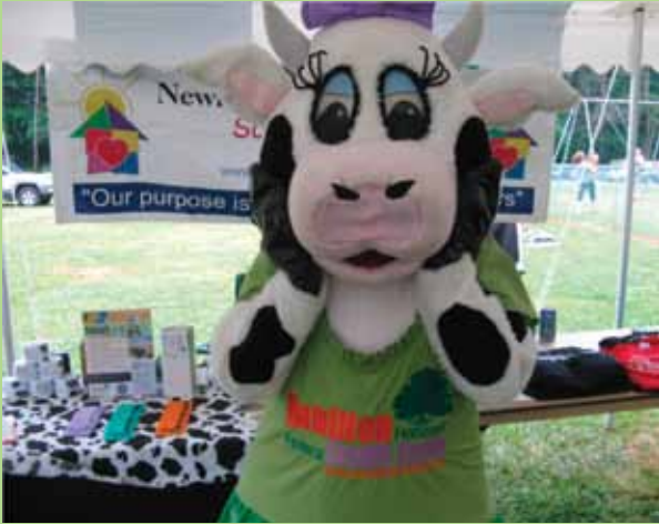
Moola the Cash Cow at the City of Angels Fundraiser.